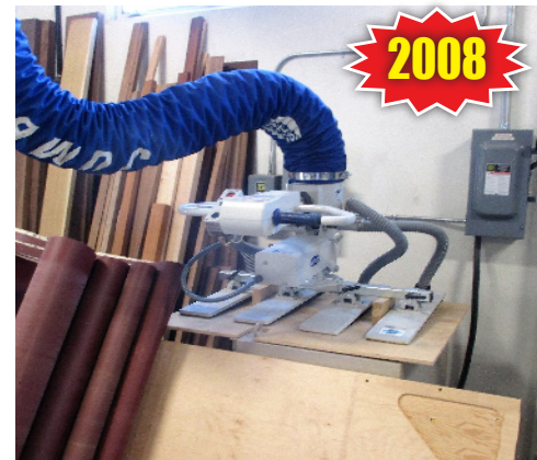
2008 SCHMALTZ MODEL BE-85 500E-STAR, VACUUM LIFTER