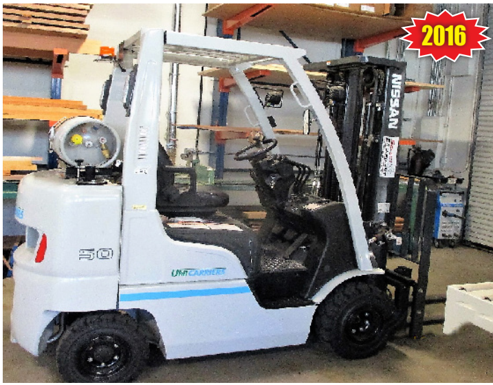
2016 NISSAN MODEL MAP1F2A25LV, 5000 LB. CAPACITY, PROPANE, SOLID TIRE, SIDE SHIFT, 3-STAGE MAST, S/N AP1F2-9U20539