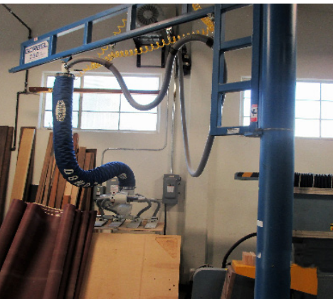
2016 GORBEL, JIB CRANE, 250 LB CAPACITY, S/N GII521