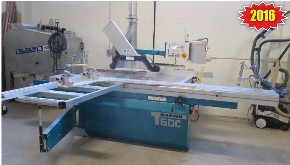
2016 MARTIN MODEL T-60C, 130MM CUTTING HEIGHT, 0-46 DEGREES BLADE TILT, 400MM BLADE DIAMETER, 3.0 METER SLIDING TABLE LENGTH, CROSS-CUT FENCE, 3.5" COLOR SCREEN, S/N 541360