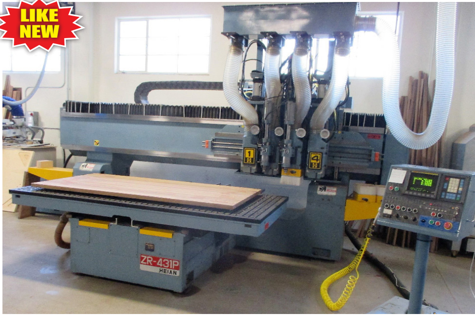
HEIAN MODEL ZR-431P, 4" X 8' NEMI GRID TABLE, (3) AXIS, XYZ TRAVELS: 112" X 59" X 7.8", (4) ROUTER SPINDLE HEADS, FANUC OM UPDATED CONTROL, COLOR CRT, S/N 92002FI-H14150