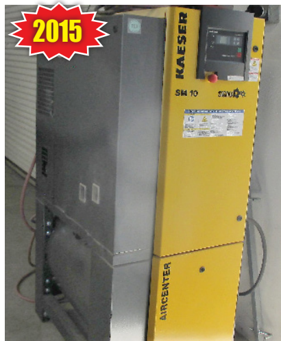
2015 KAESER MODEL SM-10, ROTARY AIR COMPRESSOR, 10 HP, S/N 1.8.8102.3

SHOP SUPPORT EQUIPMENT AND CABINETS CONTINUED...