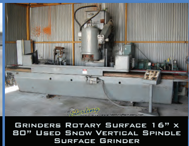
GRINDERS ROTARY SURFACE 16" X 80" USED SNOW VERTICAL SPINDLE SURFACE GRINDER