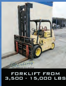
FORKLIFT FROM 3,500 - 15,000 LBS