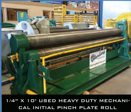
1/4" X 10' USED HEAVY DUTY MECHANICAL INITIAL PINCH PLATE ROLL