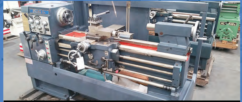
BRAND NEW LATHE NEVER USED