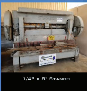
1/4" X 8' STAMCO