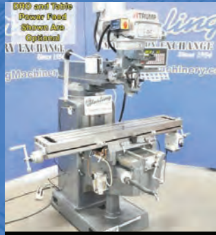
BRAND NEW MILLING MACHINE ATRUMP