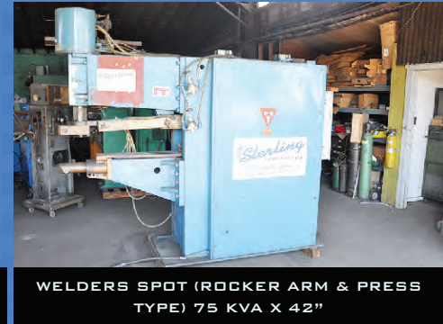
WELDERS SPOT (ROCKER ARM & PRESS TYPE) 75 KVA X 42"