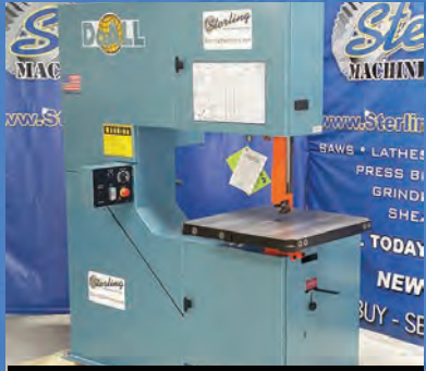
BRAND NEW 36" DOALL BANDSAW