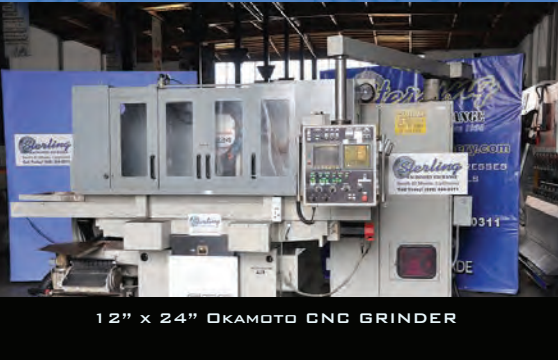
12" X 24" OKAMOTO CNC GRINDER