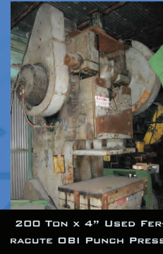
200 TON X 4" USED FER-RACUTE DBI PUNCH PRESS