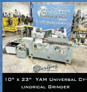
10" X 23" YAM UNIVERSAL CYLINDRICAL GRINDER