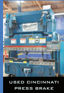
USED CINCINNATI PRESS BRAKE