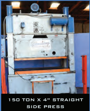
150 TON X 4" STRAIGHT SIDE PRESS