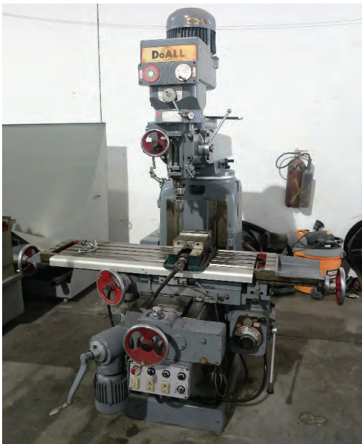
(27) VIDMAR TOOLING CABINETS, BRIDGEPORT, SERIES I, 2 HP & DOALL VERTICAL MILLS, KENT KCS-300 AHD SURFACE GRINDER, PRATT & WHITNEY 3B & 2A JIG BORES, CLEARMAN DRILLS, IMPERIAL STAMPING MACHINE, TORIT MIST COLLECTOR, (4) MILLER WELDERS, RAMCO 30 TON SHOP PRESS, GARDNER DENVER AIR COMPRESSOR, DELTA PRESSURE WASHER, STAINLESS STEEL CONVEYOR BELTS, ELECTRIC HOIST, ARBOR PRESSES, PALLET JACKS, LARGE STEEL TOOL CABINETS, DELTA PRESSURE WASHER AND RELATED ITEMS