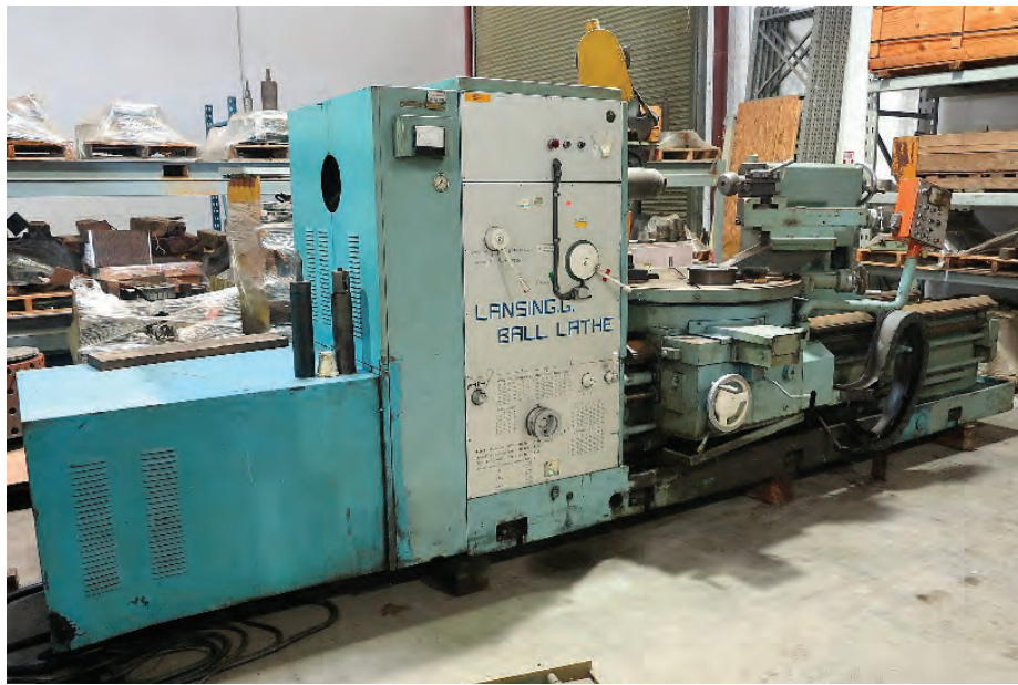
LANSING, 18" 4 JAW CHUCK, 47" INDEXING TABLE, POWER SUPPLY, BELT SANDER, S/N 211-180