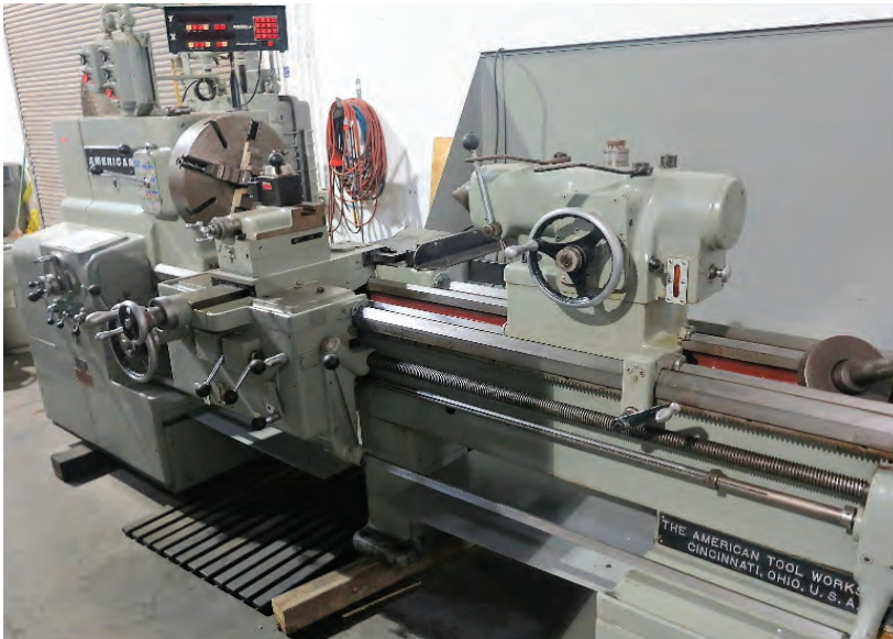
1994 AMERICAN TRACER LATHE, 20" X 54" CC, 18" 4 JAW CHUCK, S/N 77218