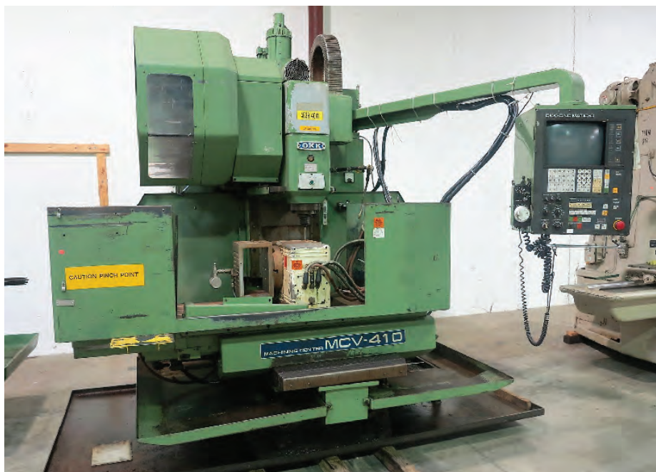
OKK CNC VERTICAL MACHINING CENTER, MODEL MCV 410, S/N 301