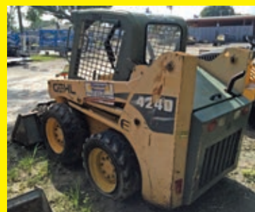
2012 GEHL SL4240E SN4240A00003204 diesel engine, rollcage, auxiliary hydraulics, mechanical quick coupler, GP bucket.