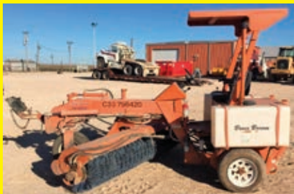
2005 BROCE BB250B SN304132 diesel engine, ROPS, 8ft. Sweeper.