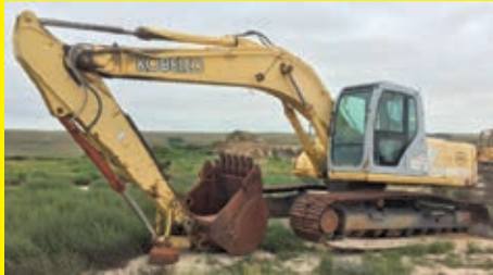
KOBELCO SK-210LC SNYQ07-U0687 diesel engine, Cab, 10ft. Stick, auxiliary hydraulics, 32in. Pads, 54in. Digging bucket, long undercarriage.