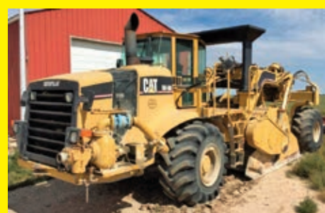
2006 CAT RM-500 SNASW00129 Cat C15 ACERT diesel engine, 540hp, Sliding cab, air, Universal Rotor, 96in. width, 16in. cutting depth, solution pump, all wheel drive, 26.5 x 25 front rubber, 23.1 x 26 rear.