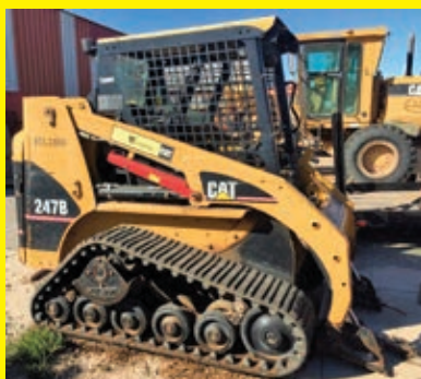
2006 CAT 247B SNMTL03600 SERIES Cat diesel engine, rollcage, auxiliary hydraulics, mechanical quick coupler, rubber tracks, GP bucket.