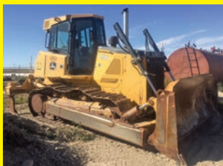
2006 JOHN DEERE 850J SNT0850JX124556 John Deere diesel engine, EROPS, air, SU blade, rear ripper, 22in. Pads.