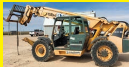
2008 GEHL DL11L-55 SN545498 4x4, diesel engine, OROPS, 11,000lb lift capacity, 55ft. reach height, front stabilizers.