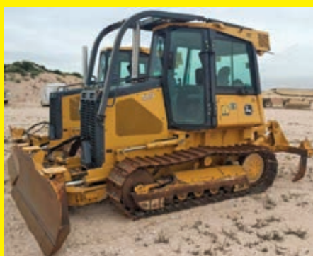
2007 JOHN DEERE 550JLT SNT0550JX137333 John Deere diesel engine, EROPS, air, sweeps, 6 way blade, 18in. Pads, rear ripper, long track frame.