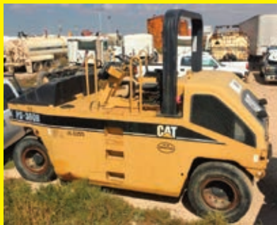
CAT PS-360B SN9LS00200 SERIES Cat 3054 diesel engine, 105hp, ROPS, 7-wheel roller, water system.