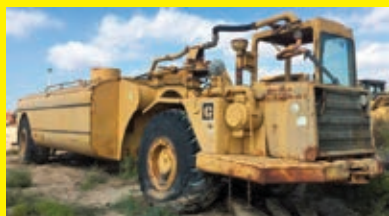
CAT 613B SN38W07000 SERIES Cat 3208 diesel engine, OROPS, Magnum 5,000 gallon water tank, 20.5-25 rubber.