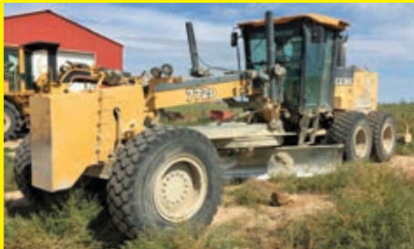
2006 JOHN DEERE 772D SNDW772DX607135 6x6, John Deere diesel engine, EROPS, air, 14ft. Moldboard, hydraulic sideshift, TIP, push block, rear ripper, 17.5R25 rubber.

2005 JOHN DEERE 770D SNDW770DX597057 John Deere diesel engine, EROPS, air, 14ft. Moldboard, hydraulic sideshift, TIP, push block, rear ripper, 17.5R25 rubber.