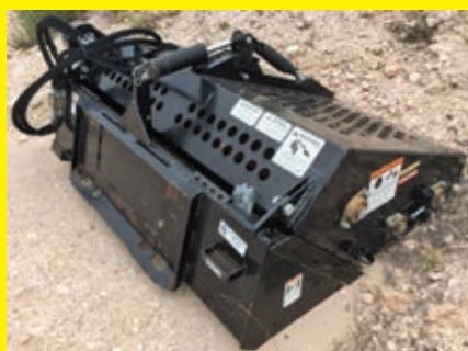
ERSKINE 76IN. LANDSCAPE RAKE