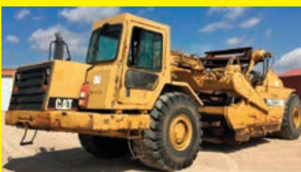
CAT 615C SERIES II SN9XG01300 SERIES Cat 3306 diesel engine, 279hp, EROPS, air, self loading, 17 yard capacity, 29.5-25 rubber.