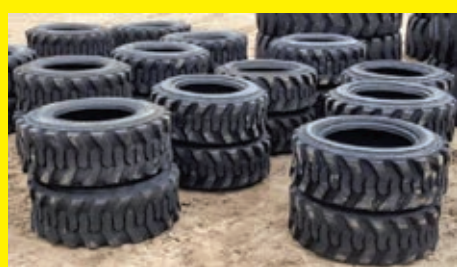
(4) NEW MARCHER 10 X 16.5 TIRES FRESH PRODUCTION JUNE 2016 USED TIRE