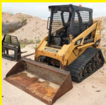
2008 CAT 247B2 SNMTL05700 SERIES Cat diesel engine, rollcage, auxiliary hydraulics, mechanical quick coupler, rubber tracks, GP bucket.