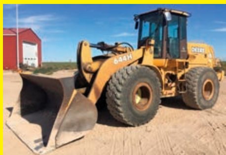
JOHN DEERE 644H SNDW644HX583466 John Deere diesel engine, EROPS, air, ride control, GP bucket, 23.5R25 rubber.