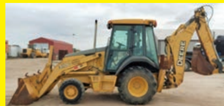
2006 JOHN DEERE 310G SNT0310GX959147 4x4, John Deere diesel engine, EROPS, air, pilot controls, extendahoe, 1.12 yard GP bucket, 24in. Rear digging bucket.