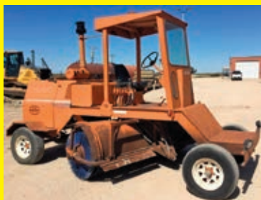
BROCE RJ-300 SNRJ30087882 John Deere diesel engine, ROPS, 8ft. Sweeper.