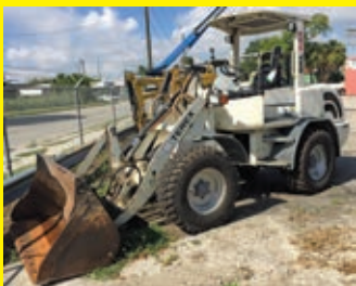
(2) 2005 TEREX SKL824 diesel engine, 50hp, OROPS, GP bucket.