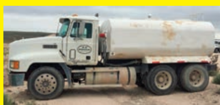
1997 MACK CH613 VN070295 Mack E7 diesel engine, 454hp, Maxitorque 9 speed transmission, power steering, double frame, 4,000 gallon water tank, air ride suspension, 11R24.5 tires, tandem axle.