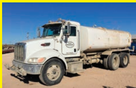
2007 PETERBILT 340 VN730526 Cat C7 diesel engine, 10 speed transmission, double frame, 4,000 gallon water tank, front rear and side spray heads, spring suspension, 11R22.5 tires, tandem axle.