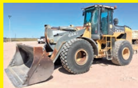
2007 JOHN DEERE 644J SNDW644JX615190 John Deere diesel engine, EROPS, air, ride control, Loadrite scale, 4.25 yard GP bucket, 23.5R25 rubber.