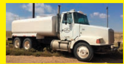
1988 VOLVO WCA VN128421 diesel engine, 9 speed transmission, power steering, double frame, 4,000 gallon water tank, spring suspension, 11R24.5 tires, tandem axle.