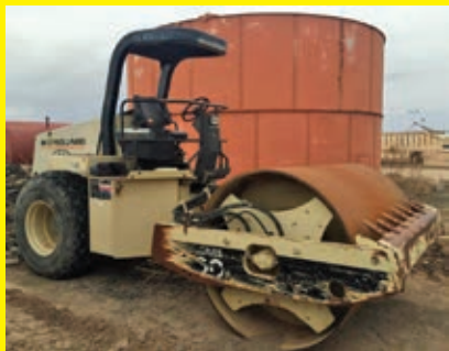
INGERSOLL RAND SD100D PRO PAC SN161396 diesel engine, ROPS, 84in. smooth drum, vibratory drum, drum drive, 23.1-26 rubber. Shell Kit Sells Separately.