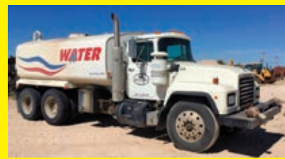
1996 MACK RD690S VN20832 Mack diesel engine, Maxitorque 7 speed transmission, power steering, double frame, 4,000 gallon water tank, front rear and side spray heads, air ride suspension, 11R24.5 tires, tandem axle.