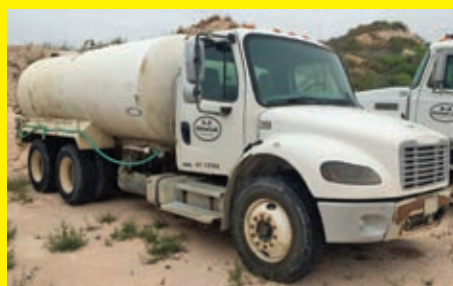
2003 FREIGHTLINER M2 106 VNL69542 Cat 3126 diesel engine, 300hp, 9 speed transmission, power steering, double frame, Ledwell 4,000 gallon water tank, air ride suspension, 22.5 tires, tandem axle.