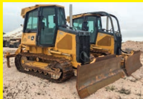
2006 JOHN DEERE 550JLT SNT0550JX128940 John Deere diesel engine, EROPS, air, sweeps, 6 way blade, 18in. Pads, rear ripper, long track frame.