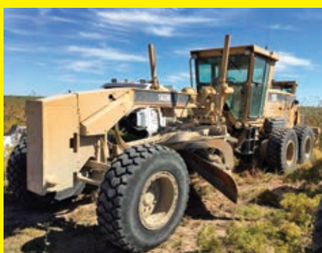
CAT 140H SNCCA00300 SERIES Cat 3176 diesel engine, EROPS, air, 14ft. Moldboard, hydraulic sideshift, TIP, push block, rear ripper, 17.5R25 rubber.

CAT 140HVHP SN2ZK07300 SERIES Cat diesel engine, EROPS, air, Variable Horse Power, 14ft. Moldboard, hydraulic sideshift, TIP, push block, rear ripper, 14.00-24 rubber.