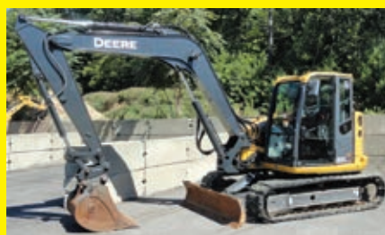
2013 JOHN DEERE 85G SNLDJ017023 John Deere diesel engine, Cab, air, heat, radio, front blade, long arm, Roadliner pads, quick coupler, 18in. digging bucket, 980 hours. 36in. Digging Bucket Sells Separately.