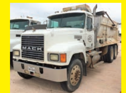
1998 MACK CH613 VN092435 Mack E7 diesel engine, 350hp, Maxitorque transmission, power steering, double frame, 14ft. steel dump box, high lift gate, tarp, rear pintle hitch, air ride suspension, 11R24.5 tires, tandem axle.