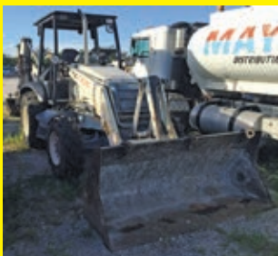
(2) 2007 TEREX TX760B 4x4, diesel engine, OROPS, GP front bucket, rear digging bucket.

2005 TEREX TX760B SN05BFM6200 4x4, diesel engine, OROPS, GP front bucket, rear digging bucket. (2) 2012 TERRAMITE T9 4x4, Kubota diesel engine, ROPS, GP front bucket, rear digging bucket