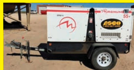
2010 MAGNUM MMG55FH SN1032099 diesel engine, 42kw, 53kva, tandem axle.