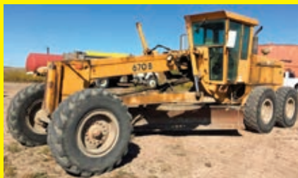
JOHN DEERE 670B SNDW670BX515283 John Deere diesel engine, EROPS, heat, 12ft. Moldboard, hydraulic sideshift, TIP, 14.00 x 24 rubber.

2005 JOHN DEERE 770D SNDW770DX597057 John Deere diesel engine, EROPS, air, 14ft. Moldboard, hydraulic sideshift, TIP, push block, rear ripper, 17.5R25 rubber.