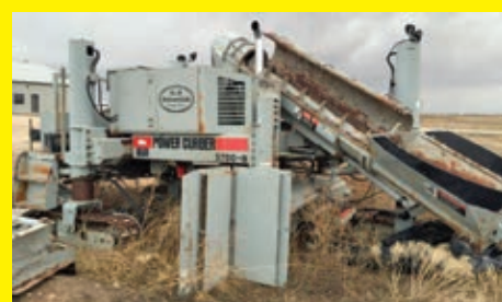
POWER CURBER 5700B SN57169628 diesel engine, 3-track drive.