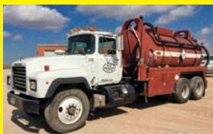
1995 MACK RD690S VN018093 Mack diesel engine, power steering, double frame, 3,200 gallon stainless vac tank, vacuum pump, 11R24.5 tires, tandem axle.