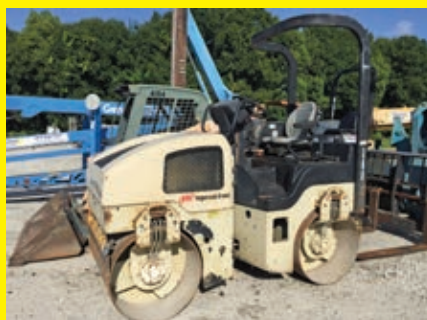
(2) INGERSOLL RAND DD24 Kubota diesel engine, ROPS, 49in. Smooth drum, double drum, vibratory drum, drum drive, water system.

HYPAC C766B SN209C2111U Cummins diesel engine, OROPS, 66in. Smooth drum, double drum, vibratory drum, drum drive.