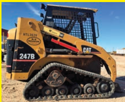
2006 CAT 247B SNMTL03900 SERIES Cat diesel engine, rollcage, auxiliary hydraulics, mechanical quick coupler, rubber tracks, GP bucket.