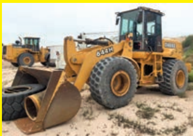
JOHN DEERE 644H SNDW644HX583447 John Deere diesel engine, EROPS, air, ride control, GP bucket, 23.5R25 rubber.