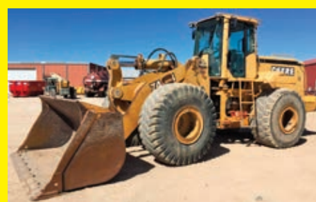
JOHN DEERE 744H SNDW744HX567548 John Deere diesel, EROPS, air, ride control, GP bucket, 26.5R25 rubber.