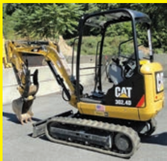
CAT 302.4D SNLJ600154 diesel engine, OROPS, front blade, pattern changer, auto idle, long arm, rubber tracks, digging bucket with hydraulic thumb, 209 hours.