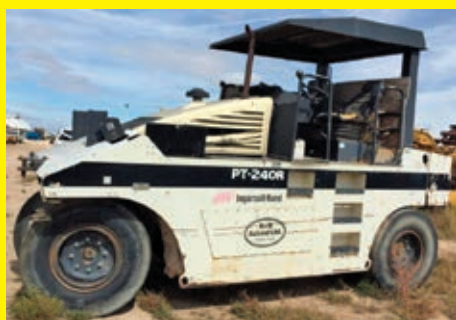
INGERSOLL RAND PT240R SN169753 Cummins diesel engine, 99hp, 8-wheel roller, water spray system, dual operator control.