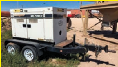
MULTIQUIP DCA-45SSIU3 SN3775833 Isuzu diesel engine, 55hp, 45kva, 26kw, 3 phase, tandem axle.