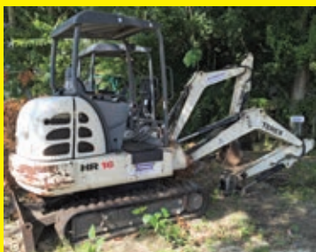
(3) 2006 TEREX HR16 diesel engine, OROPS, front blade, 11ft. 8in. Digging depth, rubber tracks, digging bucket.