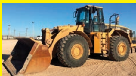
CAT 980G SN2KR04500 SERIES Cat diesel engine, EROPS, air, ride control, 7.25 yard GP bucket, 29.5R25 rubber.

2005 CAT 950G SNAXR00300 SERIES Cat diesel engine, EROPS, air, ride control, GP bucket, 23.5R25 rubber.