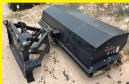
CAT BA18 ANGLE BROOM