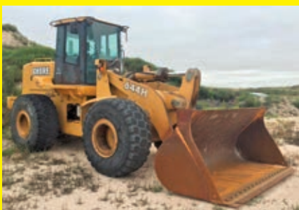
JOHN DEERE 644H SNDW644HX583450 John Deere diesel engine, EROPS, air, ride control, load scale with printer, GP bucket, 23.5R25 rubber.