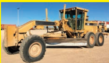
CAT 140H SN2ZK03500 SERIES Cat diesel engine, EROPS, air, 14ft. Moldboard, hydraulic sideshift, TIP control, push block, rear ripper, 14.00-25 rubber. Parts Unit.