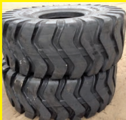
(2) NEW MARCHER 20.5 X 25, L3/E3, 24PR TIRES FRESH PRODUCTION JUNE 2016