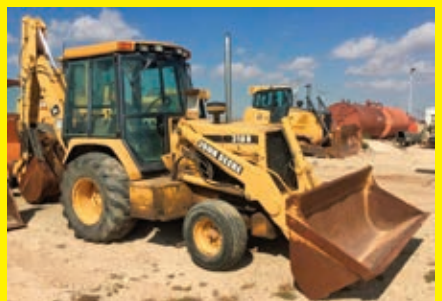
JOHN DEERE 310D SNT0310DB823522 John Deere diesel engine, EROPS, air, extendahoe, GP front bucket, 24in. Rear digging bucket.