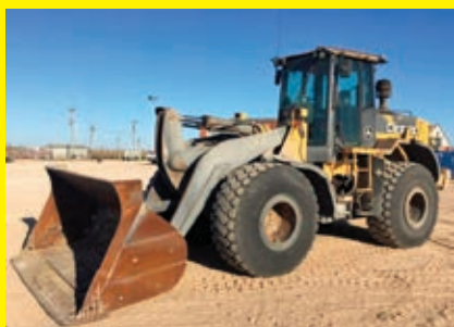
2006 JOHN DEERE 644J SNDW644JX607076 John Deere diesel engine, EROPS, air, ride control, Loadrite scale, 4.25 yard GP bucket, 23.5R25 rubber.