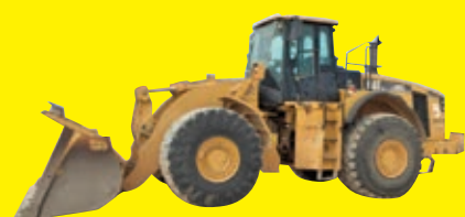
2006 CAT 980H SNJMS00700 SERIES Cat diesel engine, EROPS, air, ride control, Loadrite scale with printer, 7.25 yard GP bucket, 29.5R25 rubber.