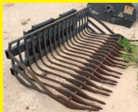
74IN. ROCK BUCKET FORKS