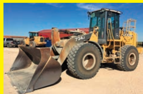
2007 JOHN DEERE 724J SNDW724JX614004 John Deere diesel engine, EROPS, air, ride control, GP bucket, 23.5R25 rubber.