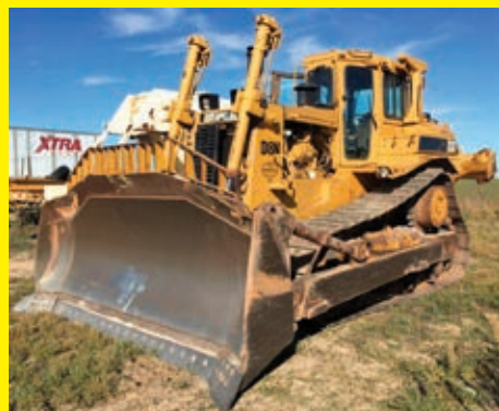
CAT D8N SN9TC04200 SERIES Cat diesel engine, EROPS, air, SU blade, Multi-shank rear ripper, 24in. Pads.