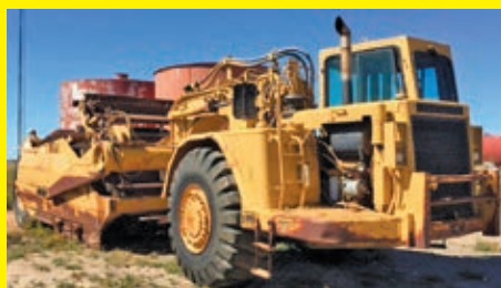
CAT 623E SN6CB00600 SERIES Cat 3406 diesel engine, 383hp, EROPS, air, self elevating, 23 yard capacity, 29.5-29 rubber.