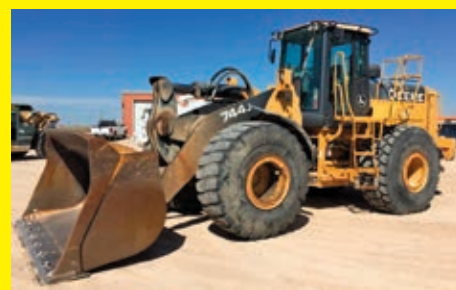
2007 JOHN DEERE 744J SNDW744JX611185 John Deere diesel engine, EROPS, air, ride control, Loadrite scale with printer, 5.25 yard GP bucket, 26.5x25 rubber.

CAT 936 SN45Z00700 SERIES Cat diesel engine, EROPS, heat, GP bucket, 23.5R25 rubber.