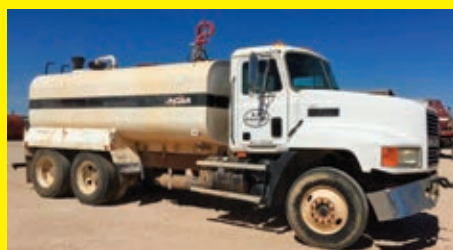
1999 MACK CH613 VN113450 Mack E7 diesel engine, 427hp, Maxitorque transmission, power steering, double frame, 4,000 gallon water tank, air ride suspension, 22.5 tires, tandem axle.