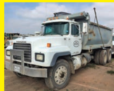
2001 MACK RD688S VN58632 Mack E7 diesel engine, 350hp, 8LL transmission, power steering, double frame, 15ft. 16 yard steel Ox box, camelback suspension, 44,000 lbs, 11R24.5 tires, tandem axle.