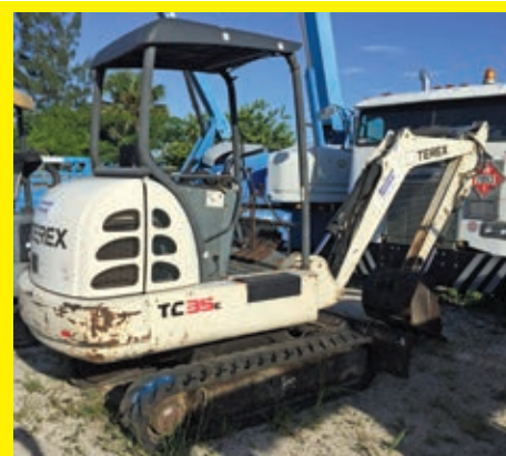
2011 TEREX TC35E SNTC035E0255 diesel engine, OROPS, front blade, 11ft. 8in. Digging depth, rubber tracks, digging bucket.