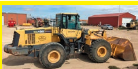
2007 KOMATSU WA480 SNA38030 Komatsu diesel engine, EROPS, air, ride control, GP bucket, 26.5R25 rubber.