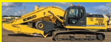
(2) 2009 KOBELCO SK210LC Fiat F4GE9684E-J6 diesel engine, 150hp, Cab, air, 31.5in. Pads, digging bucket, long undercarriage.