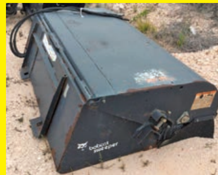
BOBCAT 72IN. SWEEPER