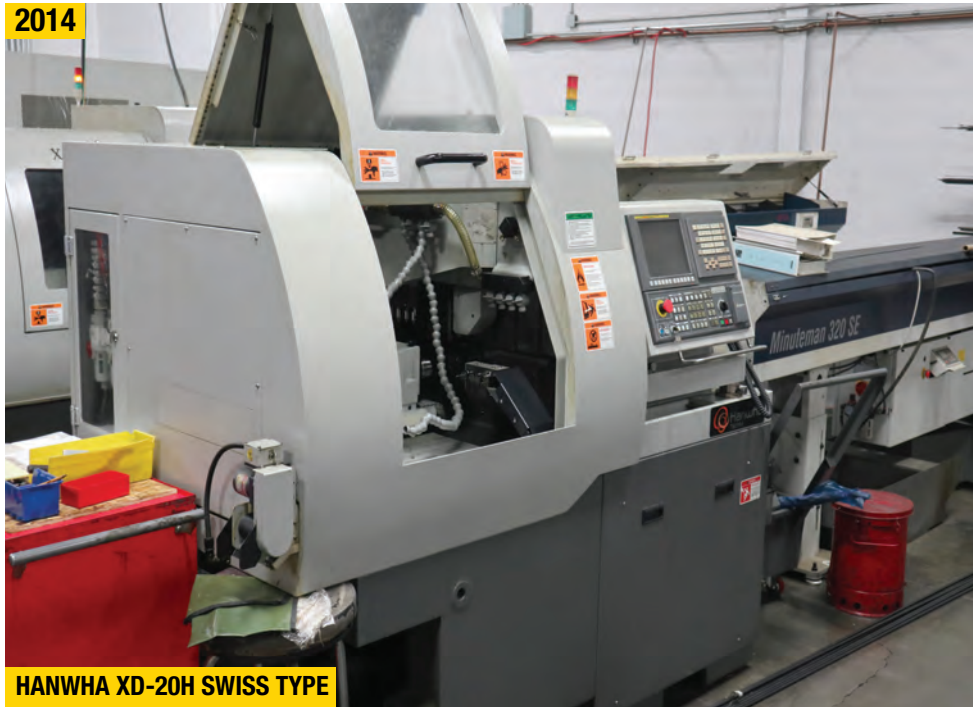
HANWHA XD-20H SWISS TYPE