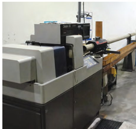
(2) CITIZEN L16 TYPE, LNS BARFEED