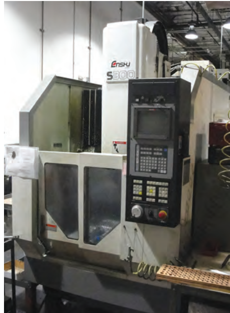
ENSHU S300, ENAC CONTROL MATSUURA MINI MATIC, YASNAC CONTROL