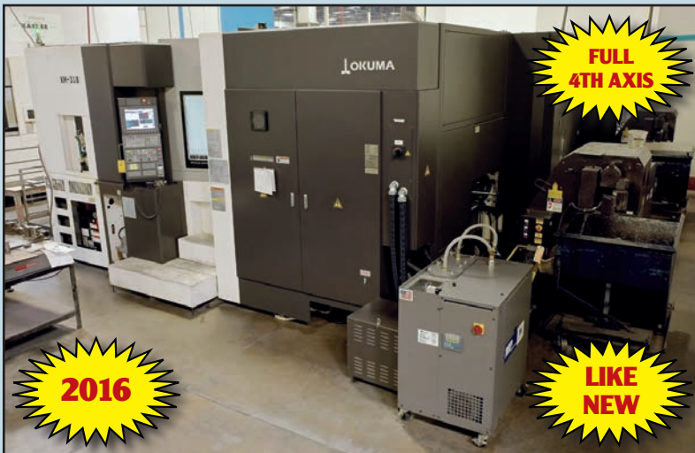
2016 OKUMA MA-600HB II Horizontal Machining Center , 60 tools, full 4th axis, 1,000 PSI coolant through and probing.