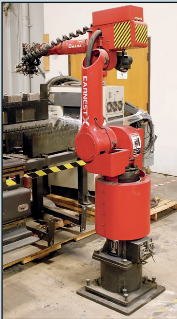
AMADA ERX 1210 Robot.