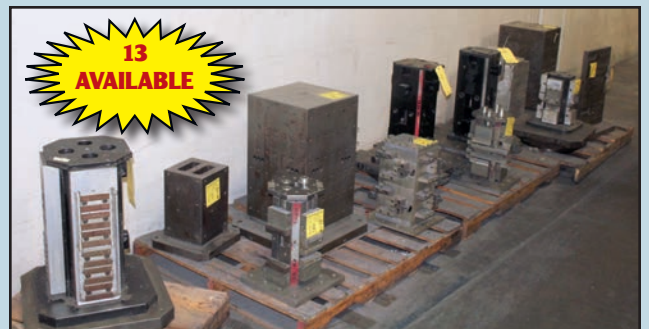
View of Tombstones.

BIDDING CLOSES: Tuesday, May 7 at 10:00 A.M.