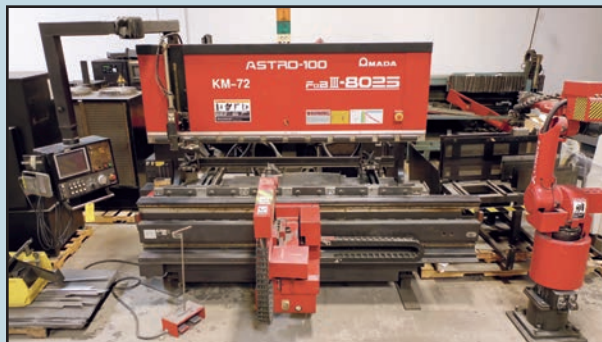
AMADA Astro-100M Robotic Press Brake, 8' bed.