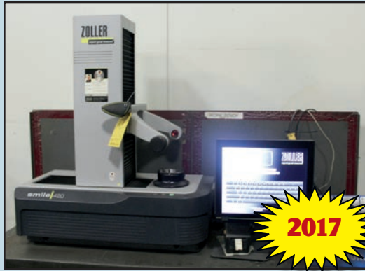
2017 ZOLLER Smile 420T Tool Presetter.