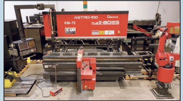
AMADA Astro-100M Robotic Press Brake , 8' bed.