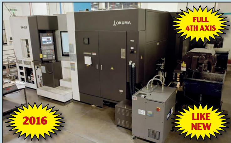
2016 OKUMA MA-600HB II Horizontal Machining Center, 60 tools, full 4th axis, 1,000 PSI coolant through and probing.