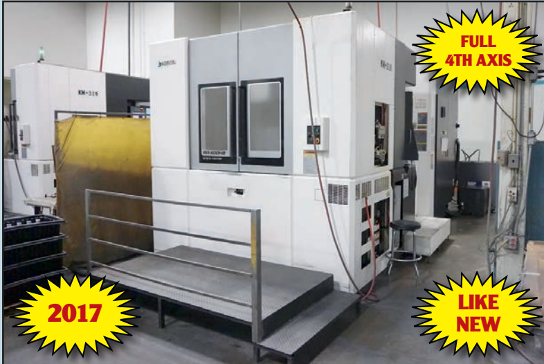
2017 OKUMA MA-600HB II Horizontal Machining Center , 60 tools, full 4th axis, 1,000 PSI coolant through and probing.

BIDDING CLOSES: Tuesday, May 7 at 10:00 A.M.