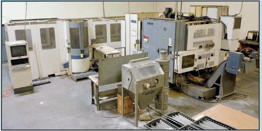
MORI SEIKI SH-503 Horizontal Machining Cell.