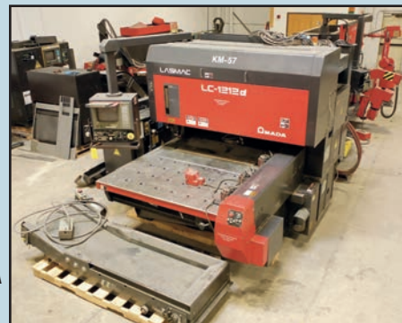
AMADA 1212A Flatbed Laser, 6' x 8' table.