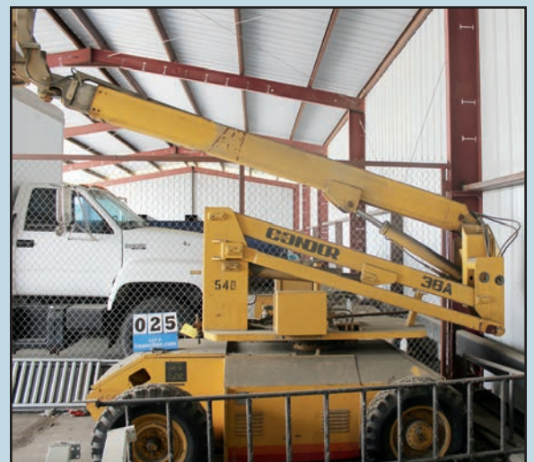
CONDOR Man Lift.

ONLINE BIDDING: YOU MUST REGISTER IN ADVANCE FOR ONLINE BIDDING AT THIS AUCTION