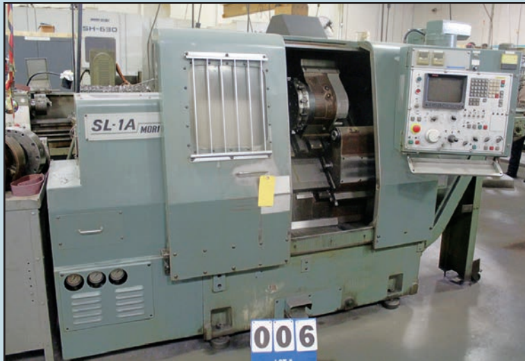
MORI SEIKI SL-1A CNC Lathe.