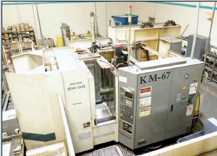
MORI SEIKI SH 50 Horizontal Machining Center.

BIDDING CLOSES: Tuesday, May 7 at 10:00 A.M.