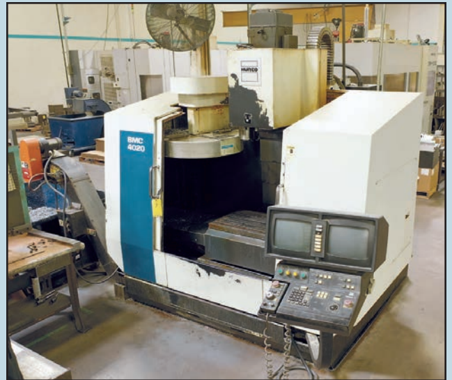
HURCO 4020 Vertical Machining Center.