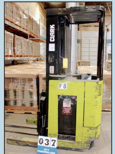
CLARK Upright Electric Forklift.