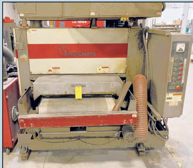
TIMESAVER 36" Wide Belt Sander.