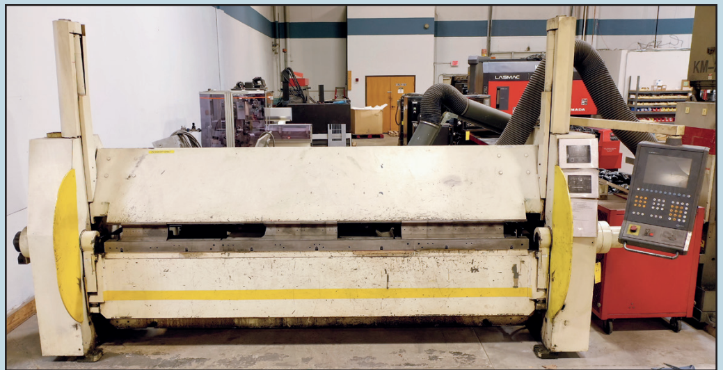
RAS Panel Bender, 10' bed with CNC backgauge.