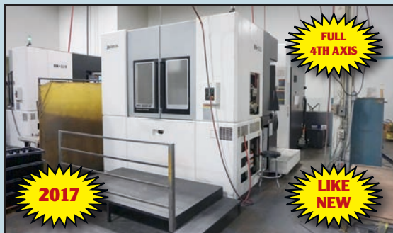
2017 OKUMA MA-600HB II Horizontal Machining Center, 60 tools, full 4th axis, 1,000 PSI coolant through and probing.