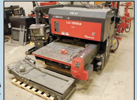
AMADA 1212A Flatbed Laser , 6' x 8' table.

Monday, May 6 from 9:00 A.M. to 3:30 P.M.