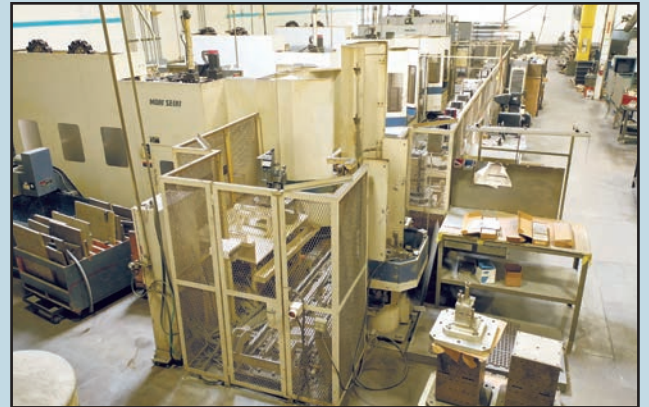
HPS Pallet System.