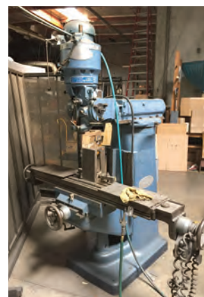
(2) INDEX MANUAL KNEE MILLS, WITH POWER FEED AND DRO'S WEBB TOOL ROOM LATHE CUTMASTER MG30 TOOL GRINDER DRILL PRESSES BALDOR DOUBLE DISK GRINDERS