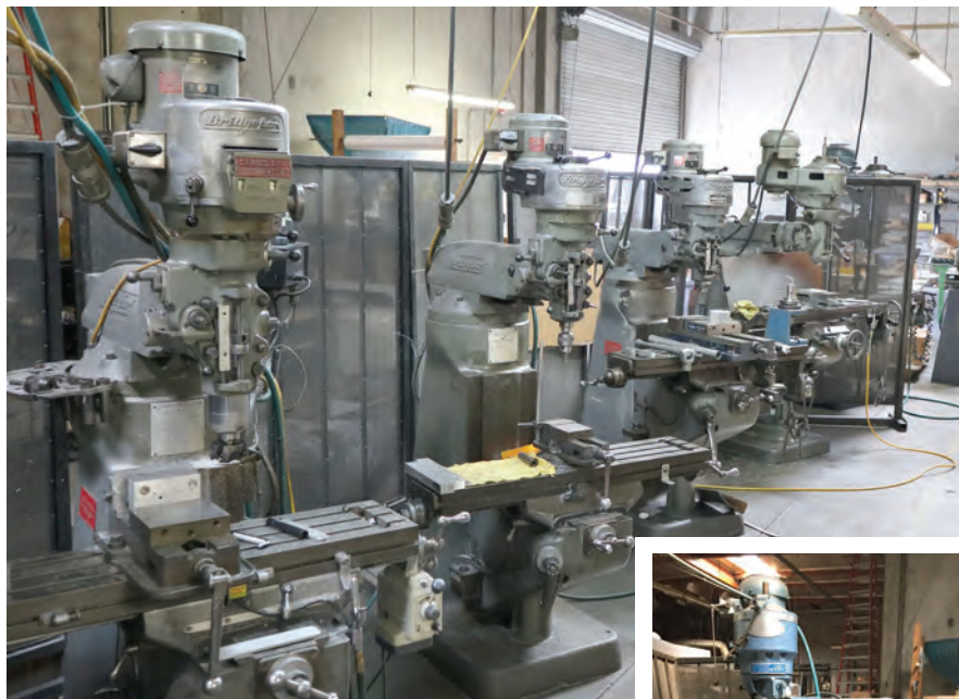
(3) BRIDGEPORT SERIES 1 AND 2 MILLS, WITH POWER FEED AND DRO'S