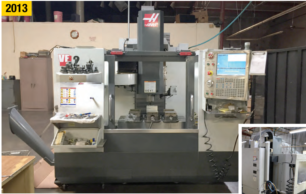
2013 HAAS VF-2, 30 X 20 X 20, PROGRAMMABLE COOLANT, CHIP AUGER