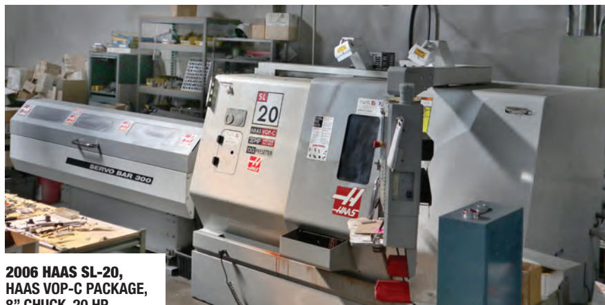
2006 HAAS SL-20, HAAS VOP-C PACKAGE, 8" CHUCK, 20 HP, HAAS 6FT MAGAZINE BARFEED, TOOL SETTER