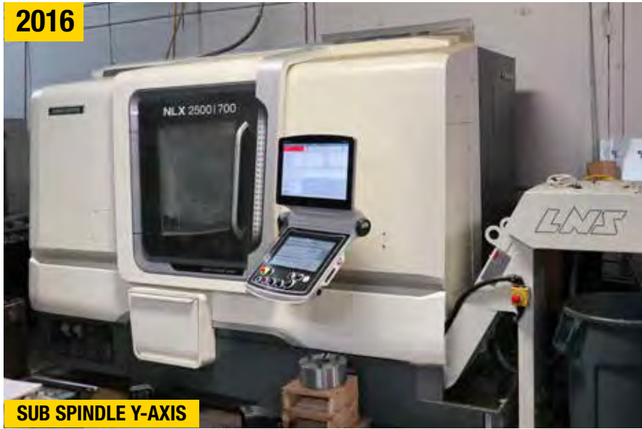
SUB SPINDLE Y-AXIS