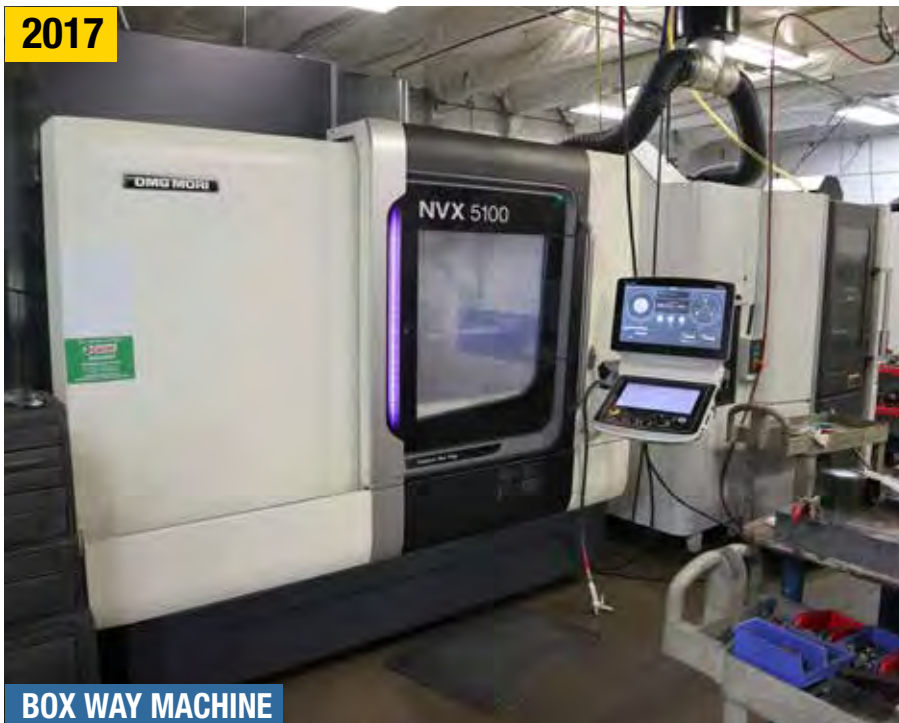
BOX WAY MACHINE