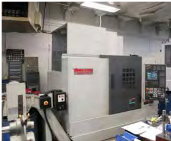
2006 MORI SEIKI DURACENTER 5, FANUC CONTROL, 31.5" X 20.1" X 20.1", CAT 40, 10000RPM, COOLANT THRU INTERFACE, CHIP WASH SYSTEM