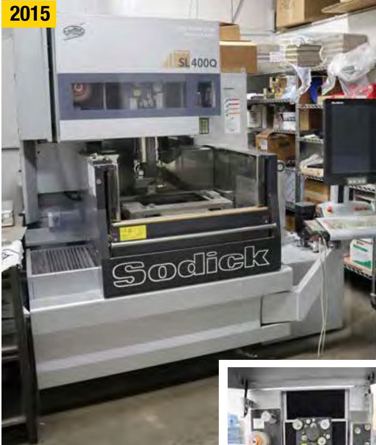
2015 SODICK SL400Q WITH LN2W CONTROL, LINEAR MOTOR HIGH PERFORMANCE WIRE EDM, 17" X 12.5" X 11", U AND V AXIS 6.10" X 6.10"