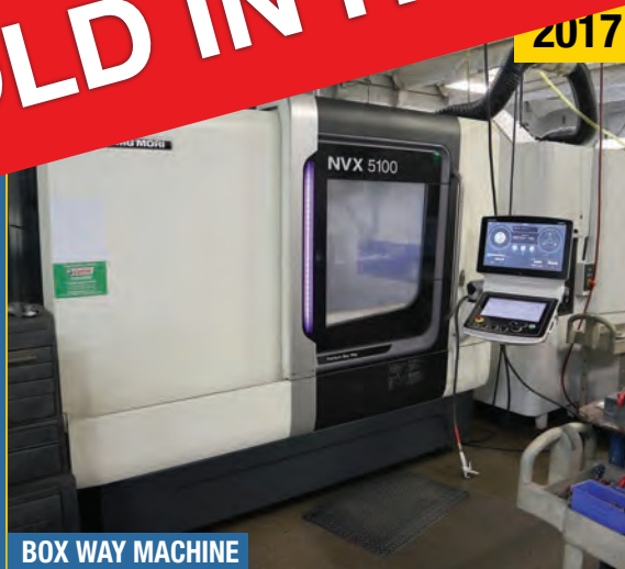
BOX WAY MACHINE