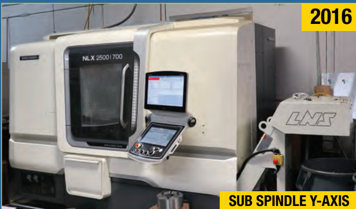
SUB SPINDLE Y-AXIS

LATE MODEL DMG MORI CNC LATHES WITH UP TO 7-AXIS, CNC VERTICAL MACHINING CENTERS, CNC HORIZONTAL MACHINING CENTERS, CNC SODICK EDM, INSPECTION EQUIPMENT, TOOLING, FORKLIFT, OFFICE EQUIPMENT AND MUCH MORE!