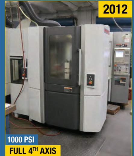
1000 PSI FULL 4 TH AXIS