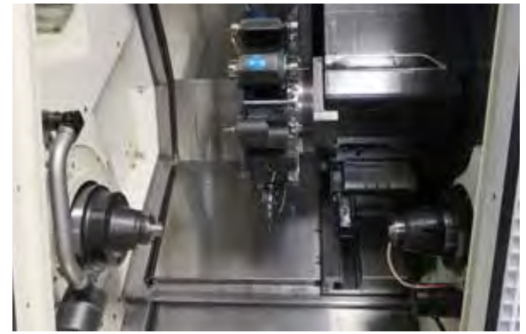
2016 DMG MORI SEIKI NLX2500SY, SUB SPINDLE, Y-AXIS, CELOS CONTROL, HIGH PRESSURE COOLANT SYSTEM, LNS CHIP CONVEYOR, FRONT AND REAR TOOL SETTERS, PARTS CATCHER 2008 MORI SEIKI FRONTIER L-II 10" CHUCK CNC LATHE, FANUC CONTROL TAILSTOCK, CHIP CONVEYOR