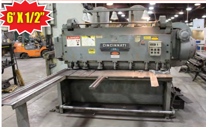
CINCINNATI 2506, 6' X 1/2" CAPACITY, 15 HP MOTOR, 50 SPM, SQUARING ARM, SHEET SUPPORTS, S/N 37478