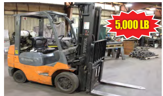
2011 TOYOTA, 5,000 LB CAPACITY, HARD TIRE, LPG, 3 STAGE MAST, SIDE SHIFT, LOAD LIGHTS