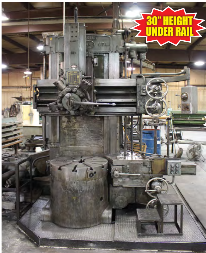
BULLARD CUTMASTER, 30" TABLE DIAMETER, 3 JAW ROTARY CHUCK, 30" MAX HEIGHT UNDER RAIL, 5 STATION TURRET, THREADING, PENDANT CONTROL, S/N 28126