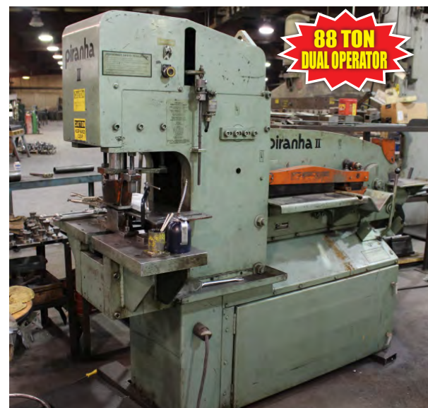
PIRANHA II, 88 TON, PUNCH, PLATE SHEAR, ANGLE SHEAR, BAR SHEAR, DUAL OPERATOR