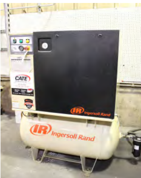
2008 INGERSOLL RAND ROTARY SCREW, 7.5 HP, TANK, S/N UP8831008171