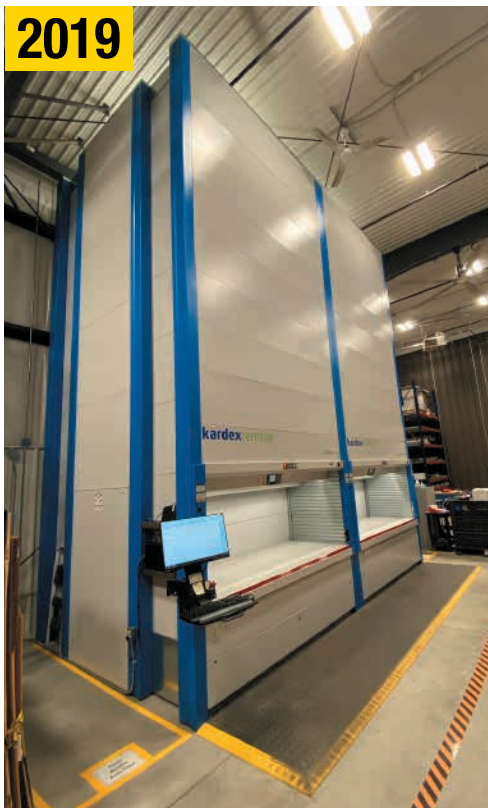
XRP 700 STORAGE SYSTEM