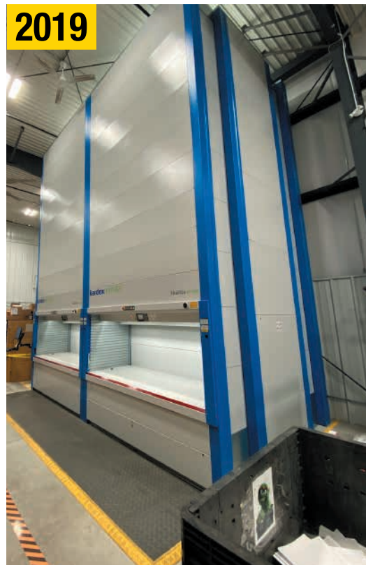
XRP 700 STORAGE SYSTEM