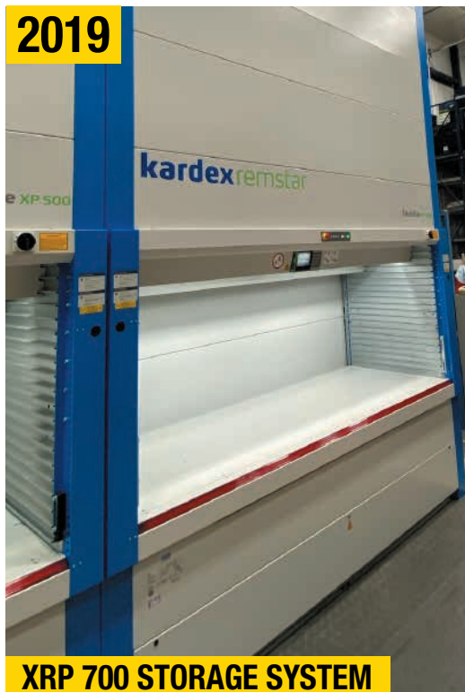
XRP 700 STORAGE SYSTEM